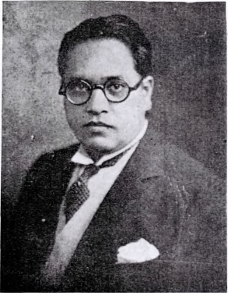
Dr. BABASAHEB AMBEDKAR

M.A., Ph.D. (Columbia); D.Sc. (London); LL.D. (Columbia); D.Litt. (Osmania); Bar-at-Law. (London)